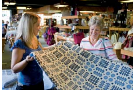
Trefriw Woollen Mill