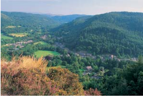
Betws y Coed

Betws-y-Coed is a lively village located in the Conwy Valley where the River Conwy meets its three tributaries, the Llugwy, the Lledr and the Machno. It has a wonderful setting surrounded by dense woodland and magnificent mountain country that is further enhanced by cascading waterfalls, hill-top lakes, river pools and ancient bridges.