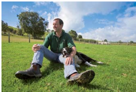
Sheep Dog Centre